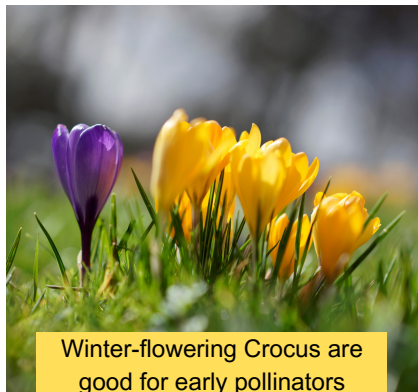
Winter-flowering Crocus are good for early pollinators

Don't forget to email your news and updates to: schools.officer@bbka.org.uk