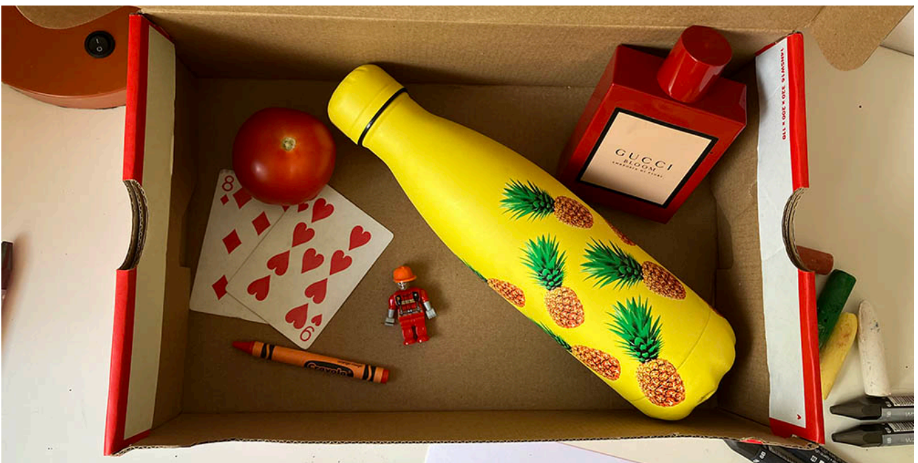
A collection of things I like

Once children have decided on the theme of their collection, give them time to collect between 5-10 objects. Once they have picked up their items they can start to arrange them in a box. Encourage students to be creative with their compositions. They may want to have objects interact with each other, arranged into a shape or have some objects stand and others lie down.