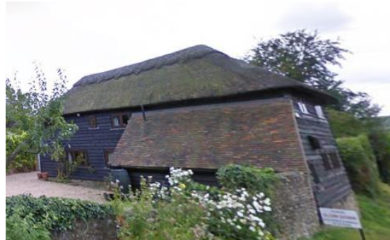
This converted barn is clad in wood with a thatched roof.