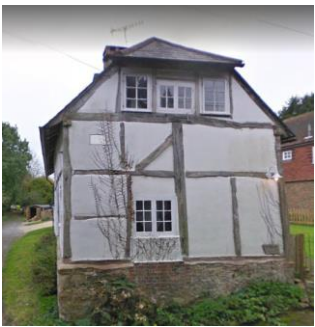
Jessamine Cottage, built in 1390 (the oldest building in Bury) is timber framed .