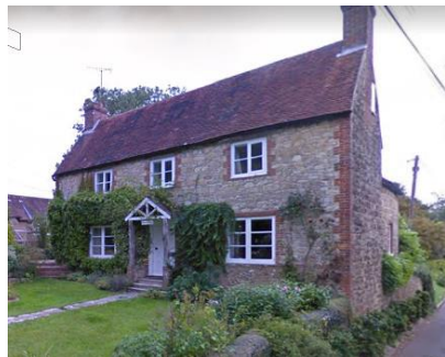
This cottage is made from stone with brick edging.