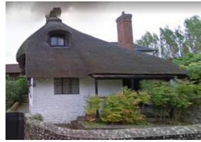
Fogdens hall house