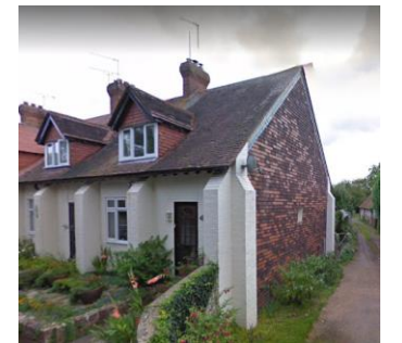
4 Squires Cottages is tile hung on the end.