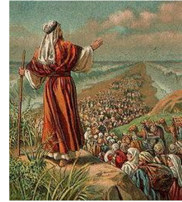
The Exodus from Egypt.