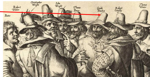
Robert Catesby Leader of a group of English Catholics who planned the failed Gunpowder Plot of 1605.