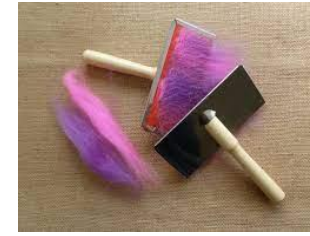
The wool is carded