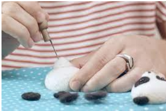
Needle felting is another way to join wool together.