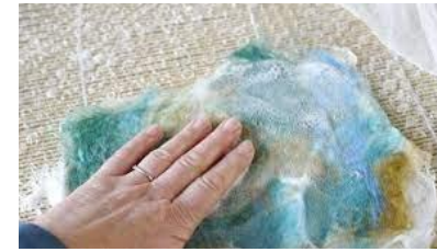
The wool is rubbed with water and soap