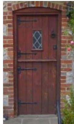
Two traditional style doors in the village, one having a stable door and one having a wooden porch over the entrance