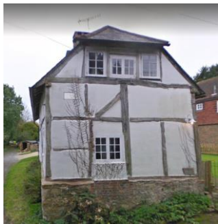
Jessamine Cottage, built in 1390 (the oldest building in Bury) is timber framed .