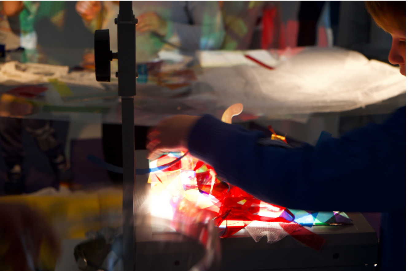
OHP and colour