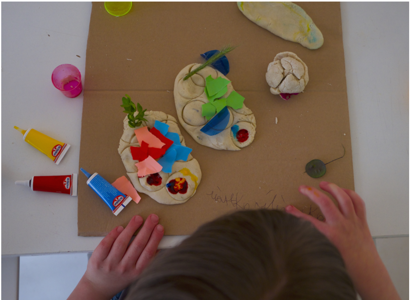
Colour and salt dough

of some children wanting to eat all the dough)! We were able to mix colours, develop fine motor skills and make whatever we wanted.