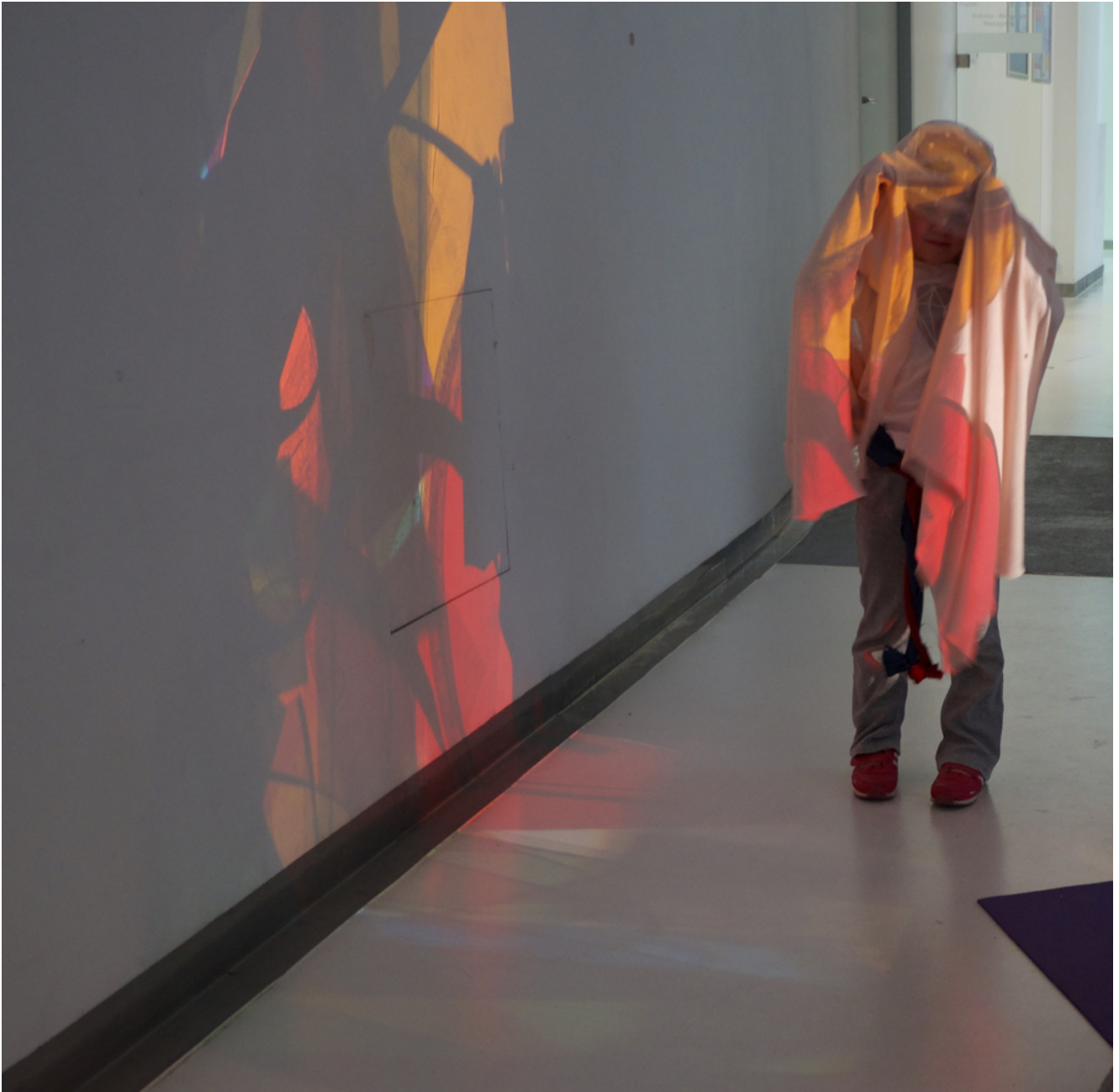
Wrapped in colour