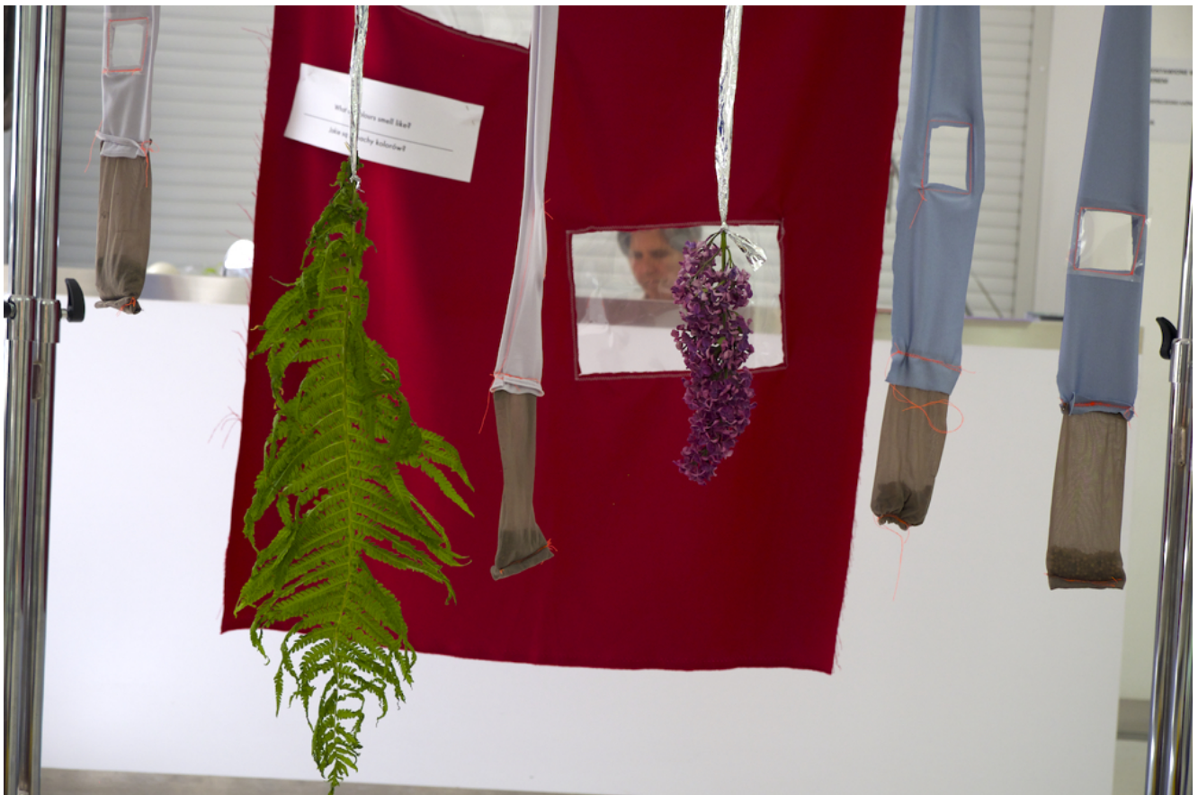
Colour and senses

I created a 'colourful smells' area by attaching bright flowers to ribbons and filling fabric pouches with herbs and spices. A simple chart of coloured paper allowed the children to match the smells with colours. Pepper was matched to black and some purple flowers were matched to the colour purple. Perhaps with another set of children the outcomes would have been different and less literal, but the group engaged with the task, considered basic colour theory and recognised smells. The children made decisions and developed their sorting and matching skills.