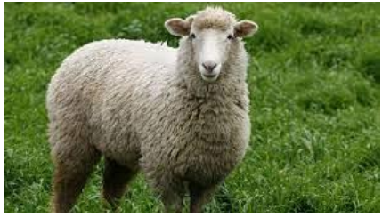
A sheep is sheared