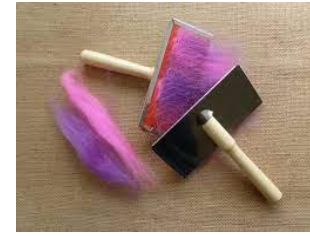
The wool is carded