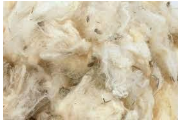
The wool is cleaned