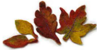
Shapes are cut out