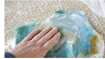
The wool is rubbed with water and soap