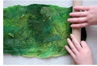
The wool is rolled