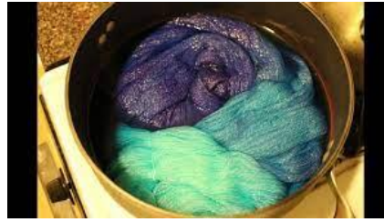
The wool is dyed