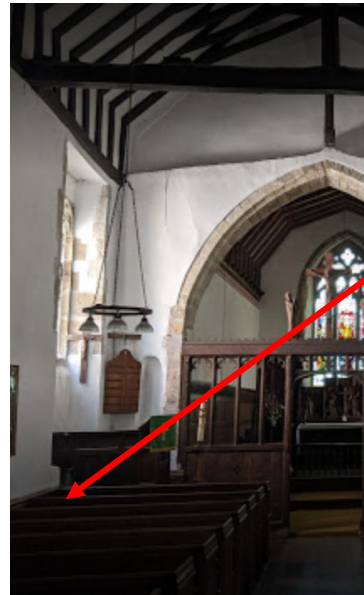
Pews made out of wood where the congregation sit.