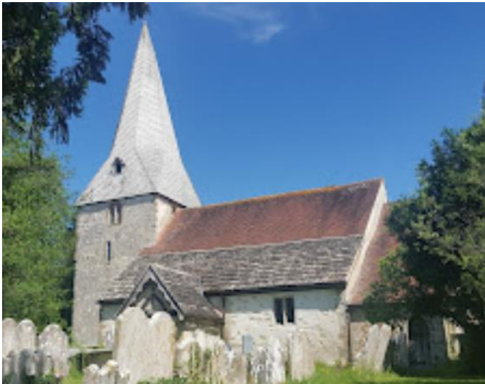
St John's Church built in 1150