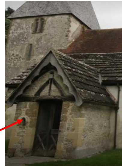
Holy water stoup In the outside wall.