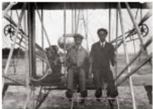
First aeroplane flight (1903)